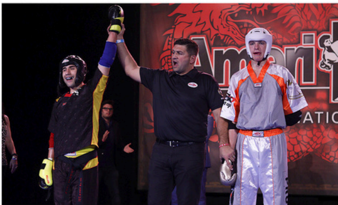
2019 OPEN WEIGHT CHALLENGE FINAL MATCH - TEAM MEXICO VS TEAM AUSTRIA