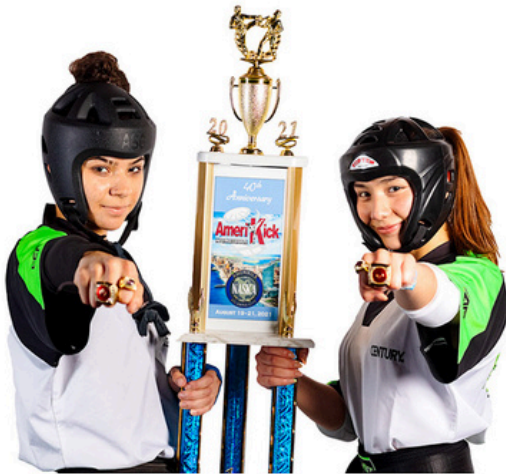
2021 WOMENS 2-PERSON TEAM SPARRING CHAMPIONS - TEAM MEXICO