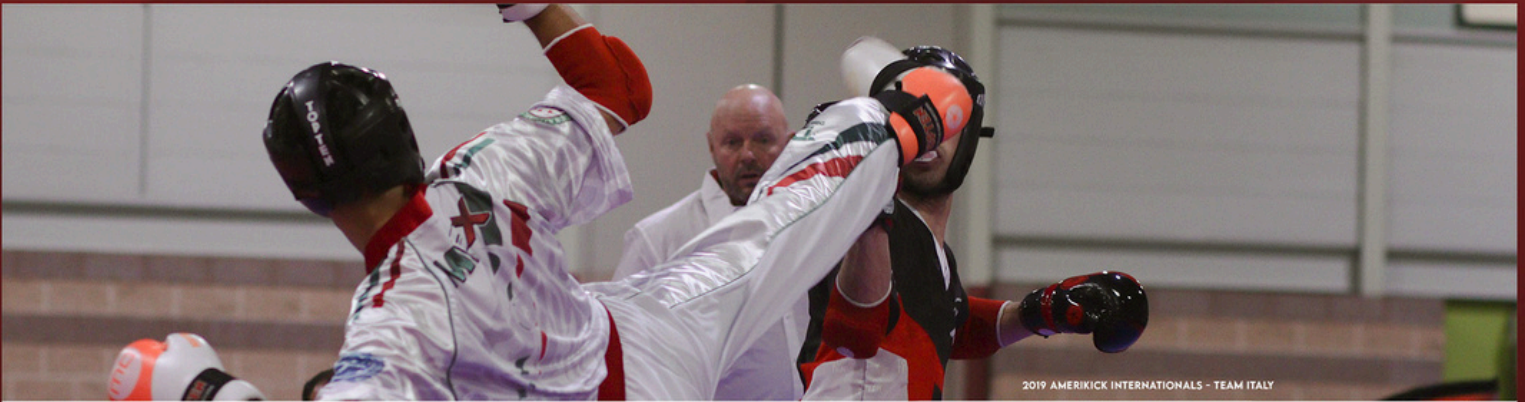
2019 AMERICKICK INTERNATIONALS - TEAM ITALY