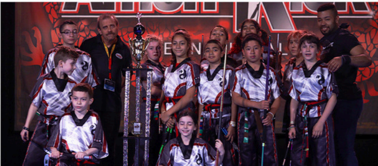
2019 AMERIKICK DEMO TEAM CHAMPIONS - AMERIKICK PARK SLOPE, NY