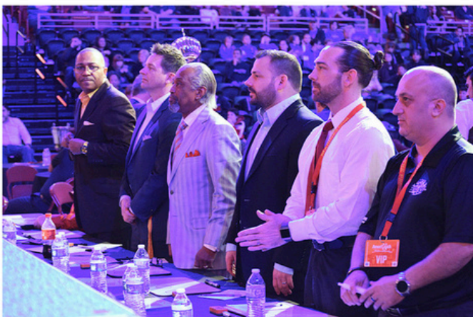
2018 AMERICKICK INTERNATIONALS SUPERSTAR NIGHTTIME FINALS SHOW